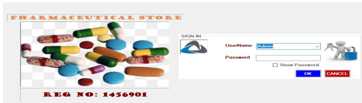
Fig 1.0 MULTIPLE USERS LOGIN

A secured login page is used to restrict unauthorized entry into the system modules. It tracks Name, time and date logged in by software users. With this, the Admin will properly monitor workers activities and be the only one authorised to access detailed information on the software.