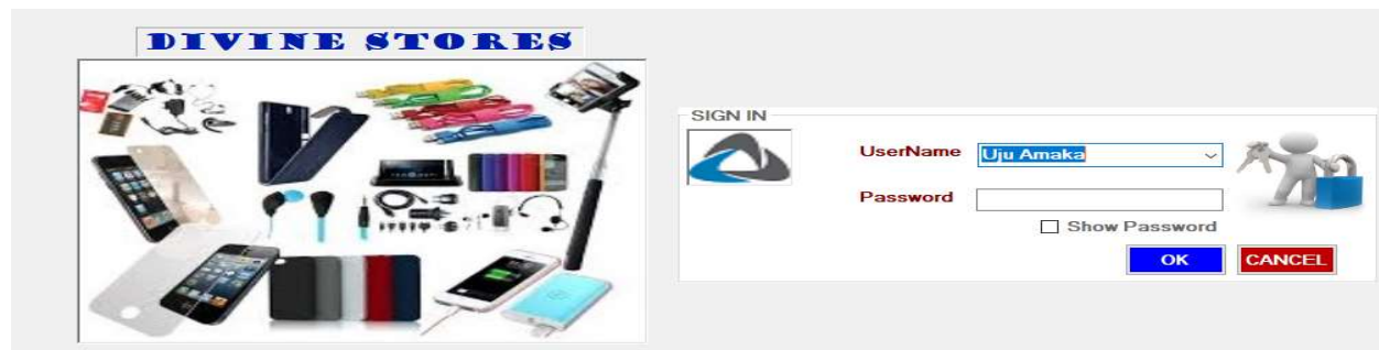
Fig 1.0 MULTIPLE USERS LOGIN

The User login page is used to track Name, time and date logged in by software users. With this, the admin will properly monitor workers activities and be the only one authorised to access detailed information on the software.