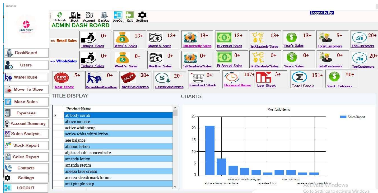
Fig 1.1 Admin Dashboard

This Module is only accessed by the manager. Here, the manager will be able to monitor daily, weekly, monthly, quarterly, bi-annual and yearly sales. Other records like total stock, new stock, finished stock, low stock is viewed at a glance.